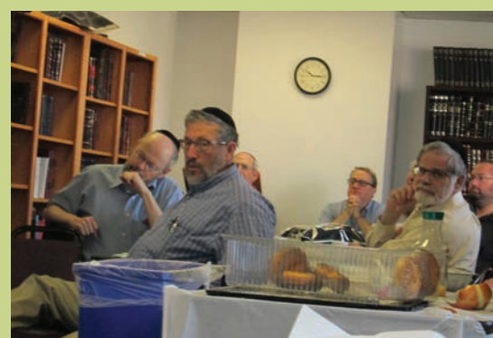
The Kollel's Legal Holiday Learning Series offered learning opportunities on the West Side and the Southeast on Memorial Day and July 4th